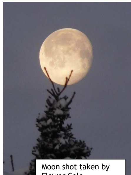
Moon shot 12-21-21