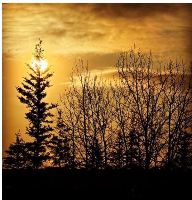
Sunset across from the airstrip, west of the Richardson Hwy March 6, 2023

Sunset photo taken at the pullout across from the main entrance of Fort Greely