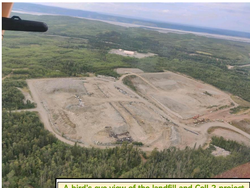
A bird's eye view of the landfill and Cell 2 project by Alan Levinson - August 20, 2023

September 4, 2023 September 19, 2023 October 3, 2023 October 10, 2023 October 17, 2023