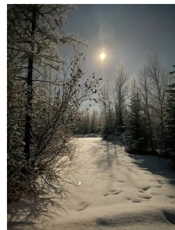
7:30am, November 28, 2023 Moon photo by Pat White →