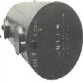
Double Compartment, Watertight Manholes