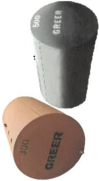
Aboveground 100-1500 gal. Underground 300-2000 gal.